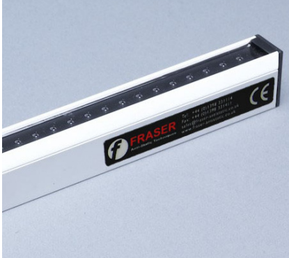
Model 1250-S Static Eliminator Bar

Static Electricity causes severe problems throughout the packaging industry, including wrapping, printing and labelling. Coding and Marking is one of the biggest areas. Many types of product are marked - including plastic bottles and containers cans, food, consumer goods, confectionery, toys, IT equipment and many others.